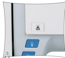
Automatic Thread Cutter