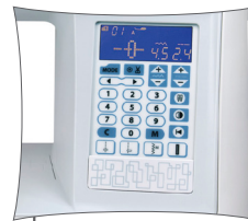
Backlit LCD Screen with Easy Navigation