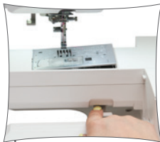
Quick change needle plates