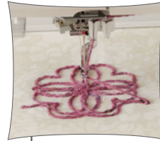
Embroidery Couching Function